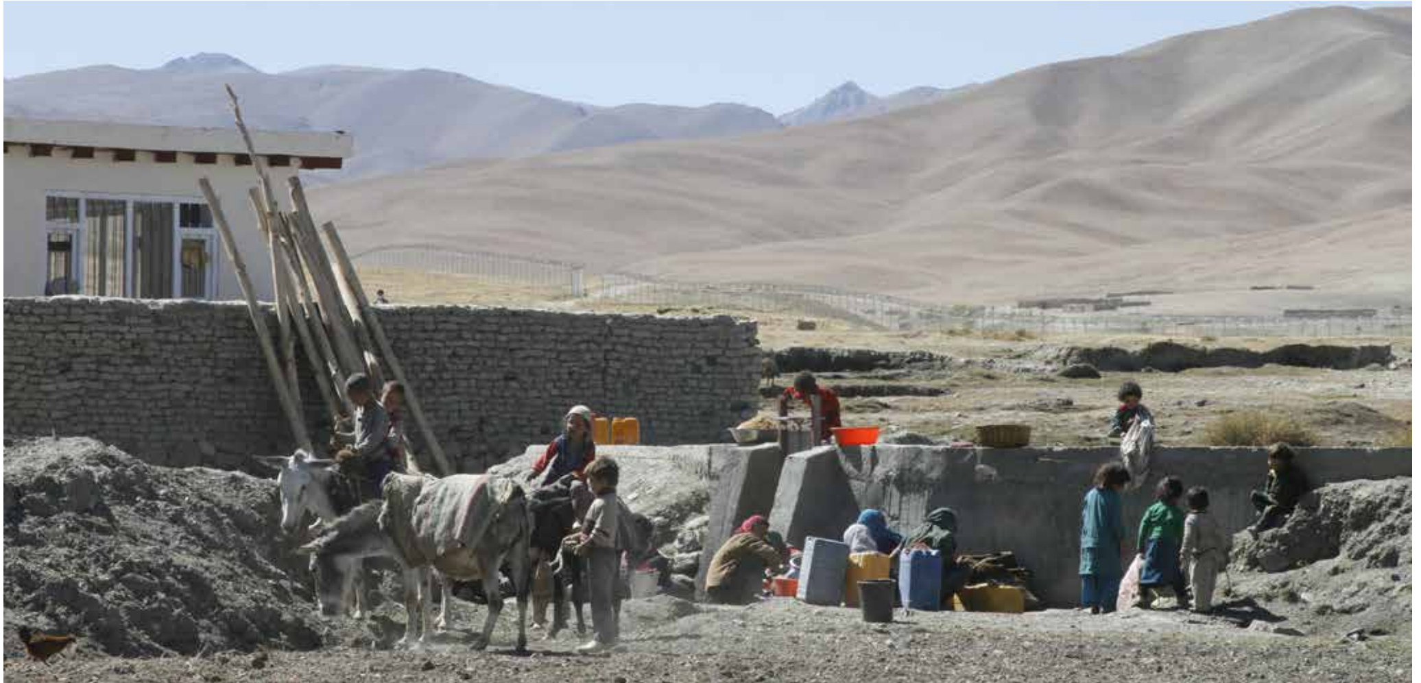
Above: Women and children use a check dam to gather water and wash clothes in Albashi Village, Bamyan District.