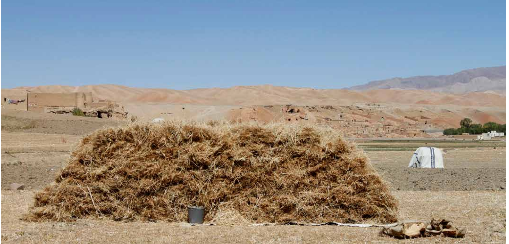
Above: Harvested wheat sold for cash provides the majority of income for many rural farmers in Bamyan Province.