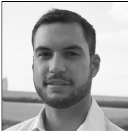
Alpha Kennedy Check Dam Project Manager